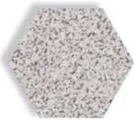
Cactus Star* M85, L85