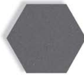
Storm ‡ M75, L75