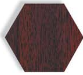
Sapelli Mahogany* M25, L25