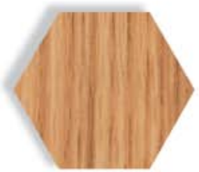
Finnish Oak* M15, L15