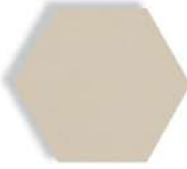
Doeskin* M65, L65