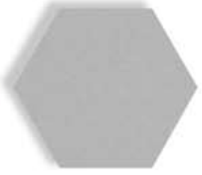
Smoke Gray* M70, L70