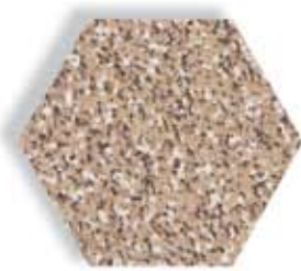
Beige Granite† M90, L90