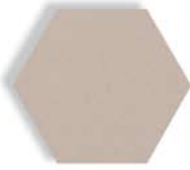
Oyster Gray* M64, L64