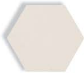
Antique White* M46, L46