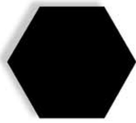
Black* M26, L26