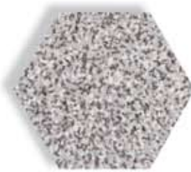
Desert Dusk* M95, L95