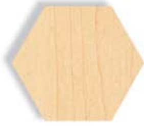
Hardrock Maple* M10, L10