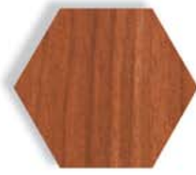
Regal Cherry* M20, L20